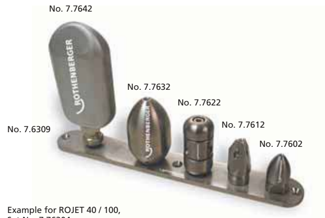
Example for ROJET 40 / 100, Set No. 7.76304